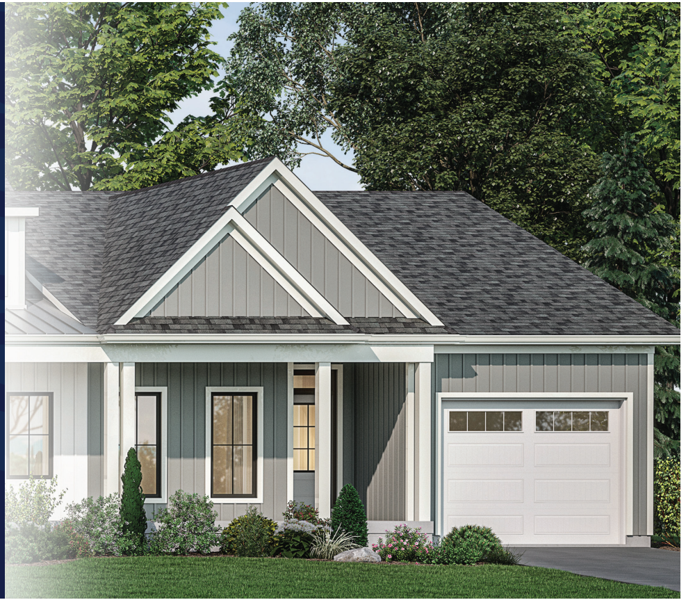
MAIN FLOOR 1401 SQFT