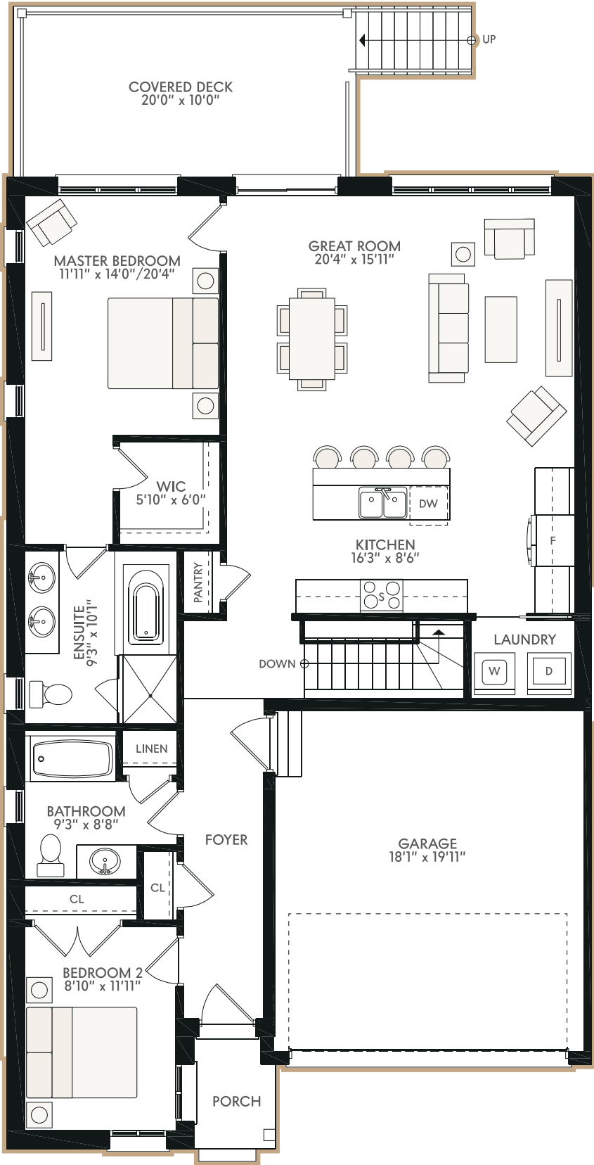
MAIN FLOOR 1428 SQFT

DOUBLE CAR GARAGE BUNGALOW TOWNHOME END UNIT