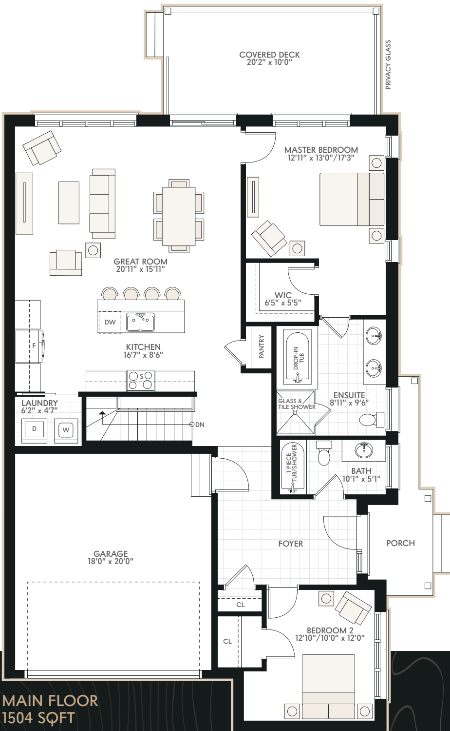
MAIN FLOOR 1504 SQFT